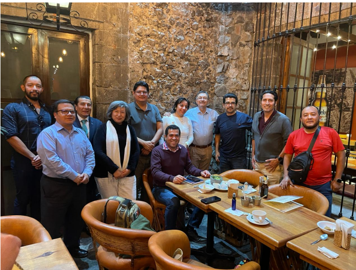
Dinner in Coyoacán (Mexico City)