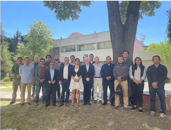
Engineering School (UNAM)